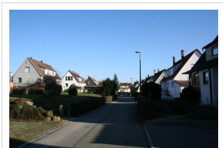
Husumer Straße in Stuttgart-Neuwirtshaus

2005 lebten in Neuwirtshaus 870 Menschen. Noch heute hat Neuwirtshaus im Vergleich zum Stadtbezirk Zuffenhausen signifikant niedrige Werte beim Ausländeranteil von nur 2006: 4% (Zuffenhausen 2005: 27%) und einem Anteil an Einpersonenhaushalten von nur 28% (Zuffenhausen 45%). Die Arbeitslosenquote liegt mit 5,0% deutlich unter der der Stadt Stuttgart (13,6%) und des Bezirks Zuffenhausen (15,7%) [7] [8] [9] . Aufgrund des relativ hohen Anteils älterer Einwohner (Durchschnittsalter 2005: Stuttgart: 41,7 Jahre, Zuffenhausen: 41,3, Neuwirtshaus: 45,9 ) sank die Einwohnerzahl Neuwirtshaus' bis vor wenigen Jahren statistisch vergleichsweise stark. [1] [8] [9]