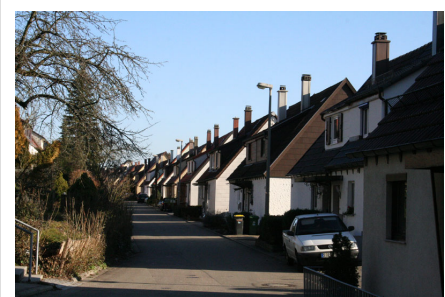
Halligenstraße in Stuttgart-Neuwirtshaus

Neuwirtshaus ist ein Stadtteil am nordwestlichen Rand der baden-württembergischen Landeshauptstadt Stuttgart. Er gehört zum Stadtbezirk Stuttgart-Zuffenhausen, ist 36,2 ha groß [1] und liegt zwischen Korntal und Stuttgart-Stammheim. Neuwirtshaus schließt nordwestlich am Industriegebiet Zuffenhausen an, wo sich unter anderem der Stammsitz der Porsche AG und die 1937 [2] eröffnete Bahn-Haltestelle Neuwirtshaus/Porscheplatz befindet.