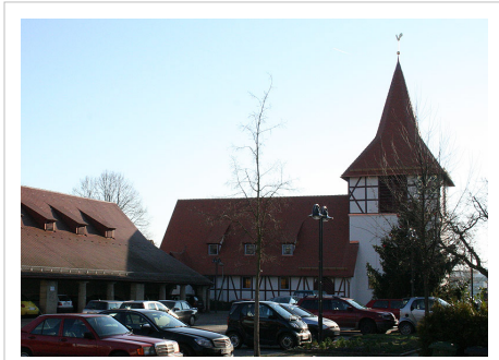
Michaelskirche (rechts) und Hochbunker (links) in Stuttgart-Neuwirtshaus